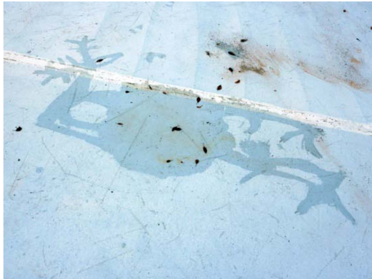
Images were made, deer's passed by...

The discovering of and presence in, the given lab-space next to work-process, offered shift and unpredictable development of artistic source... Many were the conversations... This became an interesting non-linear and also challenging practice, further also questioned, but without, much desire for "result-making". A public lab-showing, much like an installation or studio-exhibition of sound & image, sliding over in open conversation about media & artist encounters ended adventures lab week.