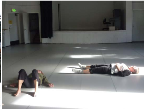
Working in and out doors & enjoying light